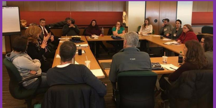
Prosecutor Round Table