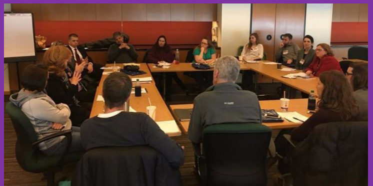
Prosecutor Round Table