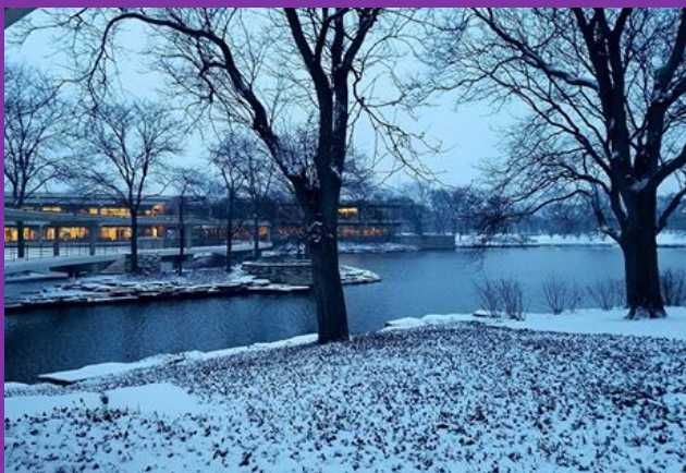
A snowy Hamburger University